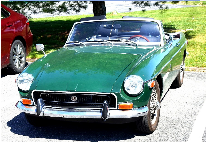
1970 Split Bumper MGB - Owner: Rory Liebrum