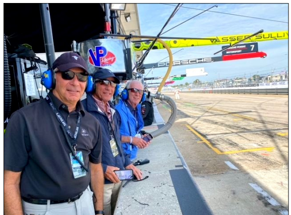
(Author: Left, Front)

One of my friends who joined us just retired as the head of Ford racing division; so he was a great resource of information and suggestions about where to stand, what to watch for, and great stories! He also arranged for us to have headsets that allowed us to listen to the Lexus team communicating between themselves and the drivers with tech information on race strategy and pit stop schedules.