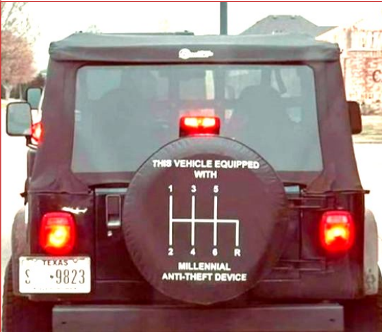
*Submitted by Howard Zlotoff